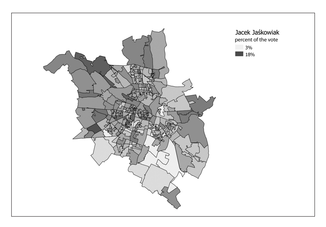
Figure 31.2 Spatial distribution of My-Poznaniacy support in 2010

the socialist middle class in the 1970s and 1980s. They were largely "unfinished utopias", to borrow Ketherine Lebow's (2013) apt phase – but in a more quotidian sense. The socialist state was notorious for building new apartments without the amenities. While for the high-rise estates these 'shortages' were about schools or retail stores, for low-rise areas the problems were even more dramatic. Although many of those areas had comprehensive plans, like in Poznań's Strzeszyn (see Figure 31.3), most of the amenities, including electricity, sewerage or telephone, had to be self-built by the residents themselves. Thus especially during the crisis-ridden 1980s, many grassroots committees were formed – exactly like in Brazilian cities described by James Holston (2008). Many of them were active during the political festival of 1988–1991, and during the 1990s were formally registered as community boards (rady osiedla).