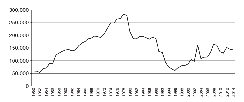
Figure 31.1 New construction in Poland, 1950–2014

Another distinctive trait is that Poland never had its own 'bourgeois revolution' that forged the middle classes. The only equivalent of the French, American or the British 'Glorious Revolution' is represented by the Second World War. It was during the Nazi occupation that the ancient regime in Poland was wiped out. For centuries before that, cities in Poland were inhabited and shaped by Jews and Germans, while Poles dominated the countryside. The "revolutionary war" (Gross 1997) changed this. While looting of Jewish property was a Europewide phenomenon (Dean et al. 2007) in occupied Poland it gained a peculiar twist. The previously marginalized Polish lower-middle classes organized gruesome "golden harvests" (Gross and Grudzińska-Gross 2012) which became a way of claiming the so-called ex-Jewish property